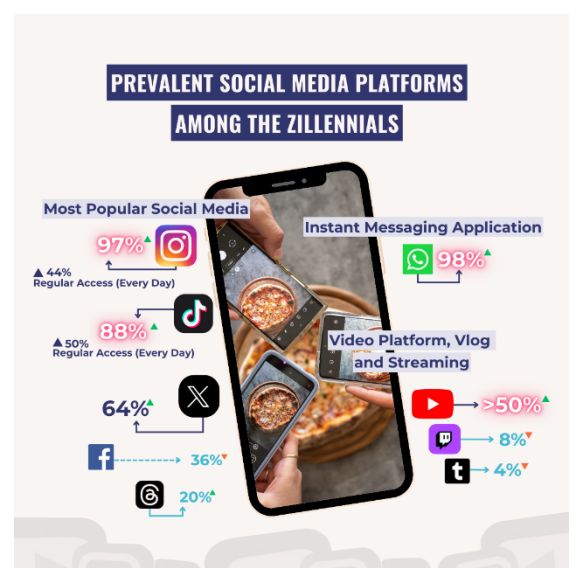
Figure 1. Prevalent Social Media Platforms among the West Java Zillennials