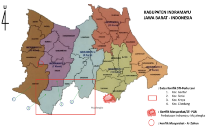
Figure 1. The Distribution of Agrarian Conflicts in Indramayu Regency, West Java

sustainable solutions. Based on field findings, the root problems in this conflict are explained in Table 1.