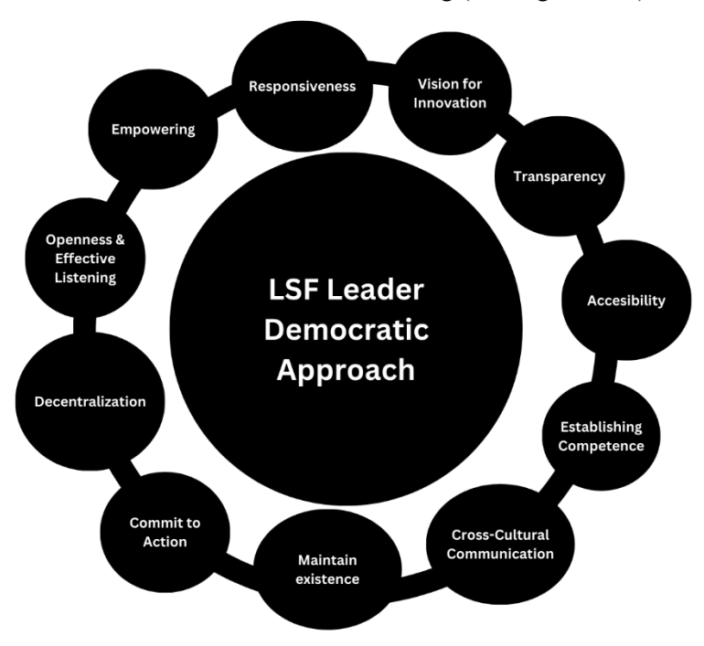
Figure 1. The LSF Democratic Leadership Communication Approaches

Democratic leaders characterized by encouraging two-way communication are most likely to provide the foundation necessary to develop solidarity (Kelly & MacDonald, 2019). The democratic leader offers guidance to group members in participating in the group and encourages member involvement in decision-making (Kilicoglu, 2018).