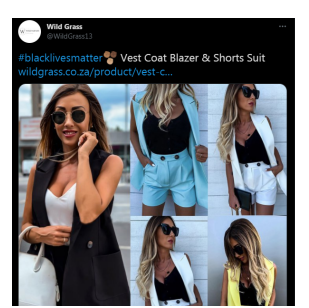
Figure 4. Irrelevant Opinions Related to Black Lives

cannot analyze the tweets uploaded. Irrelevant Tweets have a greater value than negative opinions with 15.06%. Deleted opinions and inaccessible opinions mean they want to be hidden from the public for personal reasons. One of the reasons is the fact that Black Lives Matter is a sensitive issue because it is directly related to racial and political issues. Twitter users finally tweeted #BlackLivesMatter in a more private scope or even deleted it after uploading the tweet. Twitter users do not want to risk endorsements or overreactions from other publics that do not match the tweets they are tweeting. In addition, Twitter users take advantage of #BlackLivesMatter to attract the attention of a wider public so that they can promote their accounts or products.