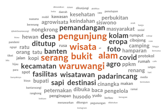
Figure 1. Word Cloud Online Media News about Bukit Waruwangi

The focus on the theme of online media coverage above shows how Waruwangi Hill has become a natural tourist destination in Serang. The media also recognize 'the otherness' of destinations in the Banten region as the distinction of Bukit Wawuwangi.