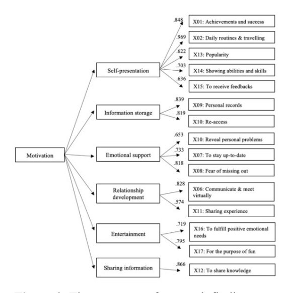
Figure 3. The summary of research findings

Furthermore, factor number 4 named "relationship development factor", consists of 2 (two) items which are: to serve as a platform to communicate and meet virtually (X06) and share experiences (X11). Factor number 5 named "entertainment factor", consists of two items which are: to genuinely enjoy creating contents (X16) and create contents as a form of entertainment source (X17). Factor number 6 consists of one item which is to share certain knowledge or issue (X12). This last factor is named the "sharing information factor".