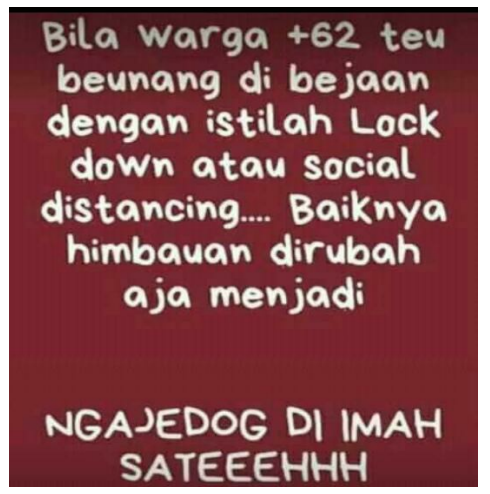
Figure 7, Meme Appeals for Silence at Home

Individuals who make memes or humor like this could be motivated by leisure, entertainment, to pique because people ignored government appeal.