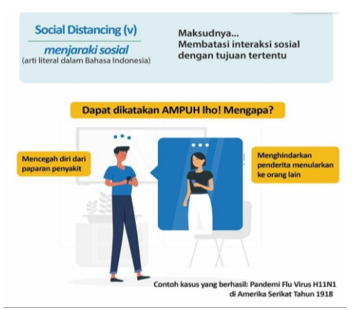
Picture 1 . Explanation of Social Distancing

Meanwhile, the information presented by the language of daily life that tend to be rough and using a style of humor, are likely to be understood by the lower social class groups.