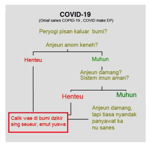
Figure 4. Meme Appeals for Silence at Home

Humor appeared not only in normal and relaxed. In times of crisis or war, humor often emerges as a medium to criticize policies, politicians, and so on. In addition, humor is often used as a medium for information dissemination, education, and understanding of situations that