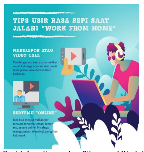
Figure 2. Tips to Banish Loneliness when Silence and Work from Home

social distancing in the community is very widely used in a variety of information, both issued by the government, media, schools, NGOs, and the community.