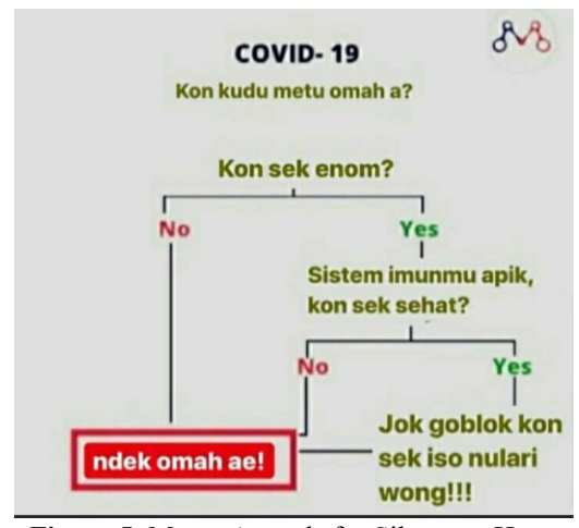
Figure 5. Meme Appeals for Silence at Home

Figure 4 and 5 are play information or memes from Figure 3. Both of these data show an appeal to stay at home aimed at young children. Some young people think that they are young and have good endurance. Therefore, they are not worried about doing activities outside the home. This is not in accordance with the recommendations of the government and society in general. Figure 4 shows the data play using the language. Meanwhile, figure 5 shows a play by using the Java language, Java dialect easterlies.