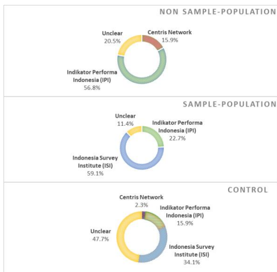
Figure 1. Comparison of Respondents’ Response on Sample-Population Survey Frame

Once cross tabulation was conducted, the experimental data result was known and it indicates a significance value of Pearson Chi-Square at 0.000 with 4 degrees of freedom (df) (see Table 3). Therefore, the result shows a significant figure. Since the probability significance value < 0.05 then H1 is accepted. In line with the research hypothesis, if H1 is accepted then the evaluation heuristics of online news sample-population frame is different from non sample-population frame.